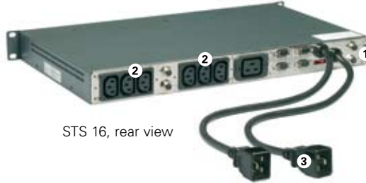
STS 16, rear view