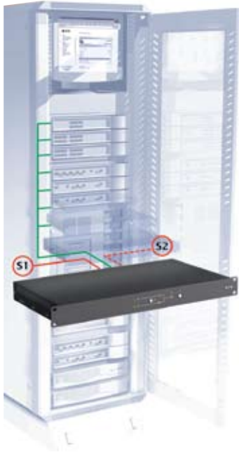
Eaton STS 16